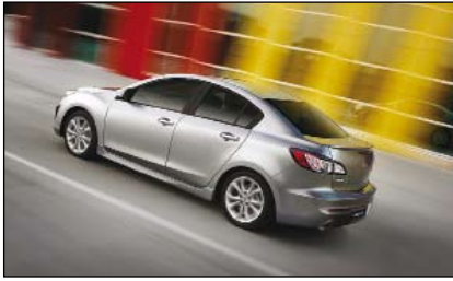
Mazda3 From $21,990